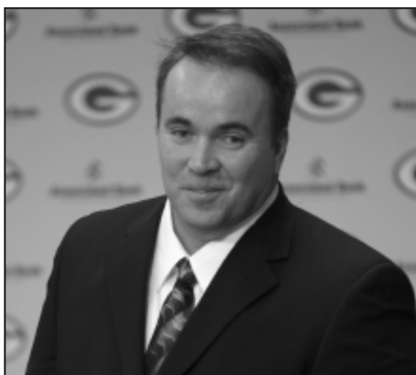
Mike McCarthy was named the new head coach for the Packers. He replaces Mike Sherman, who was fired after a 4-12 season.

Before last season, Sherman succeeded in Green Bay. He won three division championships in his six seasons. The team won 59 games and lost 43.