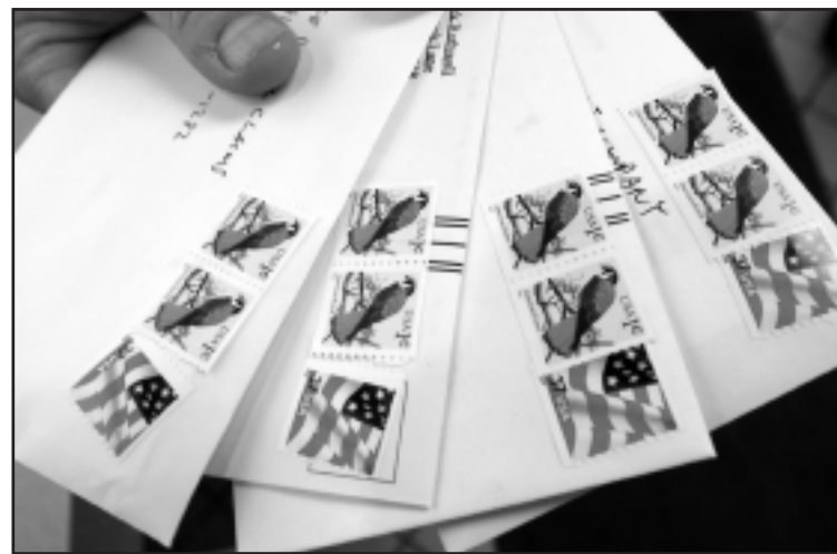
It costs Americans two cents more to mail a letter. The letters shown above each have a 37 cent postage stamp and two one-cent postage stamps. Without the extra stamps, the letters will not be delivered.

Concerns include rising fuel costs. Also, fewer people are using the mail system these